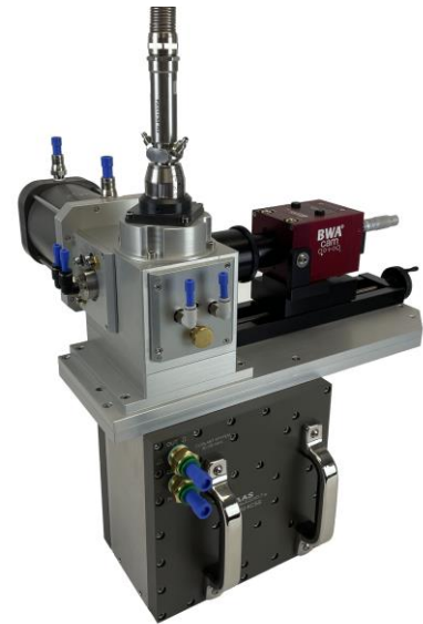
20 kw Fiber input BWA-MON