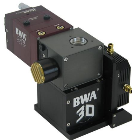
BWA-MON For 3-D Additive Applications

**Power Over Ethernet (POE) Injector or switch, 48V 15.4W Power Over Ethernet, IEEE 802.3af Compliant, 10/100/1000Mbps and Category 5e, 6, or 6a cables only are not included with system.