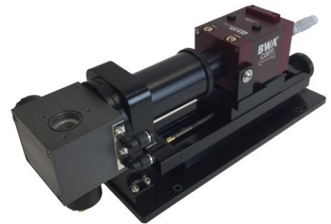
Post Focus BWA-MON

The patented † BA-CAM, BWA-CAM & BWA-MON systems provide the most versatility and ease of use when diagnosing laser beams with powers up to 30 kilowatts. This technology provides the best solution for high power laser applications. The systems are very modular and can be configured for a wide variety of applications, wavelengths, and laser powers.