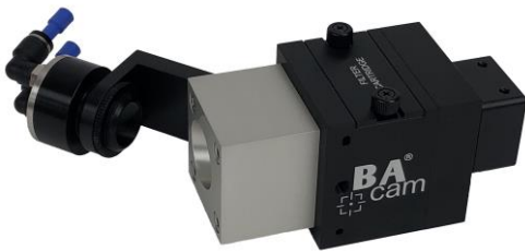
High Power BA-CAM